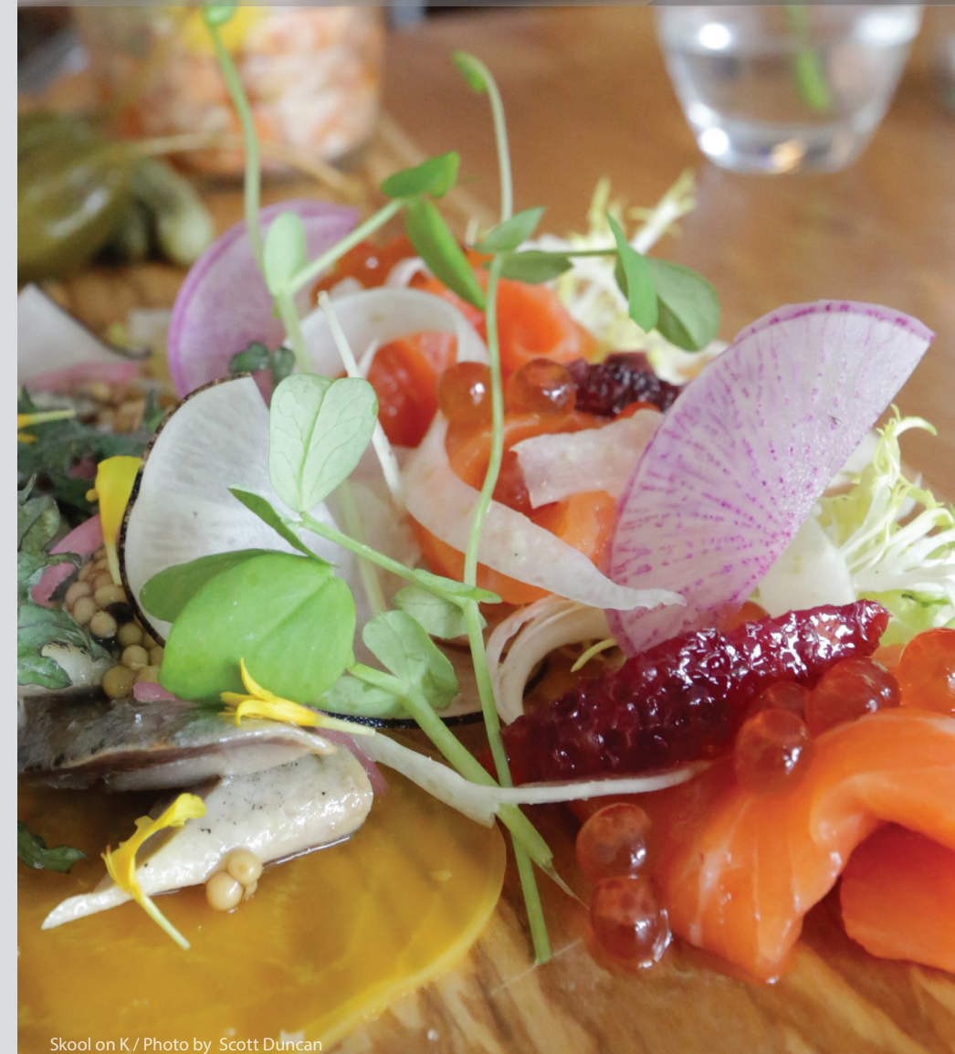
Skool on K